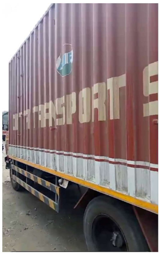
Page 4 of 4